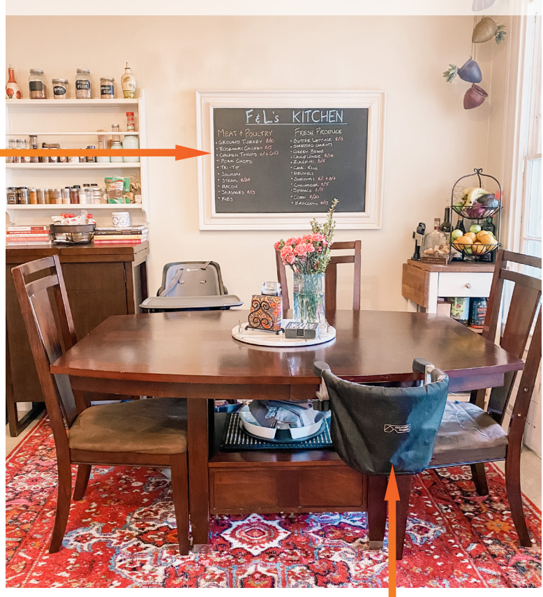
Clip-on child seats can be added during the day for meal-times

You can keep your adult dining room feel, and