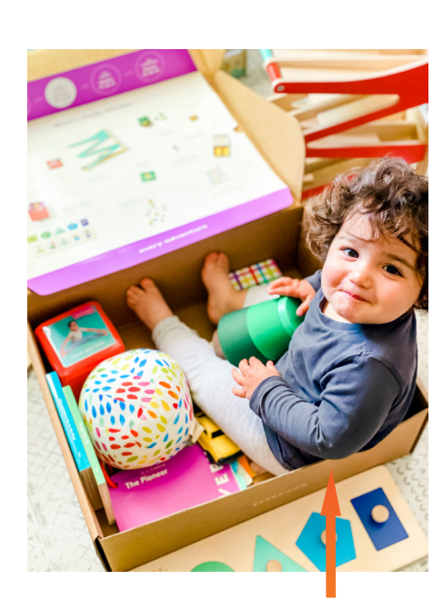
Have play kits that can come out during the day and are easy to put away at night

Child care furniture can be blended with your adult home décor, like this adult chair mixed with a children's play area